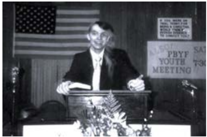
Northside Baptist Church, in Newport News, VA.

During summer vacation from High School that year I also held several revival and youth meetings, such as seen in the picture above.